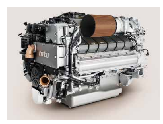
The MTU 12V 2000 M96 engine from Rolls-Royce Power Systems

SPW has also introduced a new range of automatic feathering propellers for sailboats, the Variprop GP (Grand Performance). According to Adamczyk, the design of the Variprop GP allows for a 10% reduction in fuel consumption while also delivering high thrust. "Less fuel consumption equals less CO2-emissions and extended cruising range,"