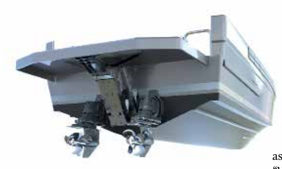
H+B's single-arm lift system for small boats

double sterndrives. The lift arm and all stern-mounted components are made of electropolished, 316 Tigrade stainless steel, and the entire system is shipped preassembled for easy installation. "We're seeing greater demand