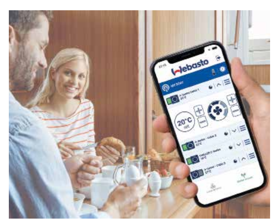
Webasto's BlueCool Connect

"The self-contained marine air-conditioning systems have also been selling very well, not only to boat manufacturers but also in the aftermarket." Cerutti adds. "Here, customers understand the importance of a modern, reliable air-conditioner on board to provide perfect comfort levels. They definitely make the precious time on board even more relaxing, particularly in the times of the ongoing pandemic." IBI