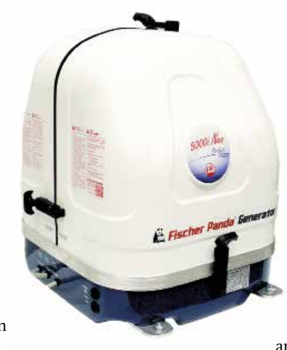
A true best-seller: The 4kW Panda 5000i.Neo marine generator from Fischer Panda

halt production for several weeks. Since then, however, business has swiftly picked up. "Since last summer, we've experienced very strong demand for marine generators," he says, adding that sales in 2021 should return to the high last seen in 2019.